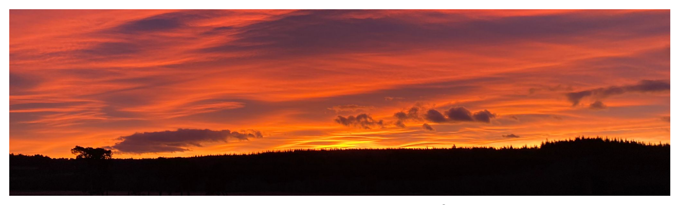
A beautiful February Black Isle sunrise

2023 has been flying by and we have lots of news to share.